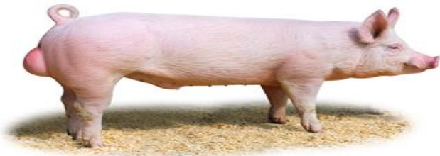
Large white (LW) boar

Pig farmers carry out a lot of crossbreeding to get the best of the characteristics of both breeds above e.g.