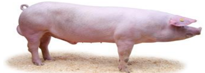
Landrace (LR) boar