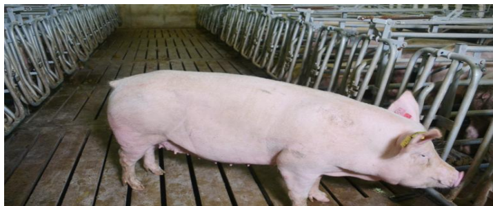
F2 (2 nd generation) sows (LW xLR) X LR

The F2 sows would then be crossed with a Large white boar and so on :