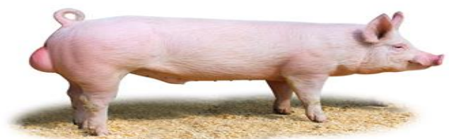
Large white boar

This system of cross – breeding is called “criss – cross” breeding